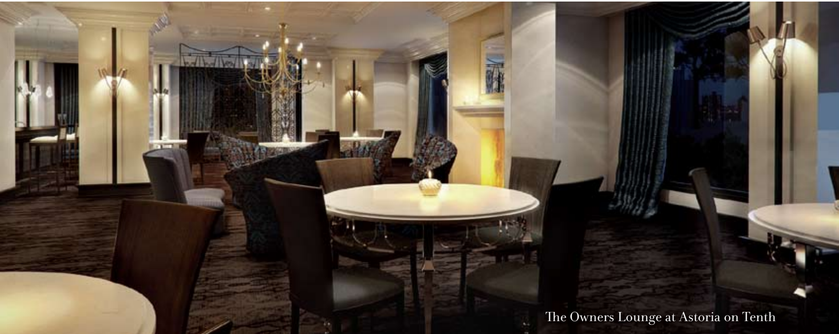
The Owners Lounge at Astoria on Tenth