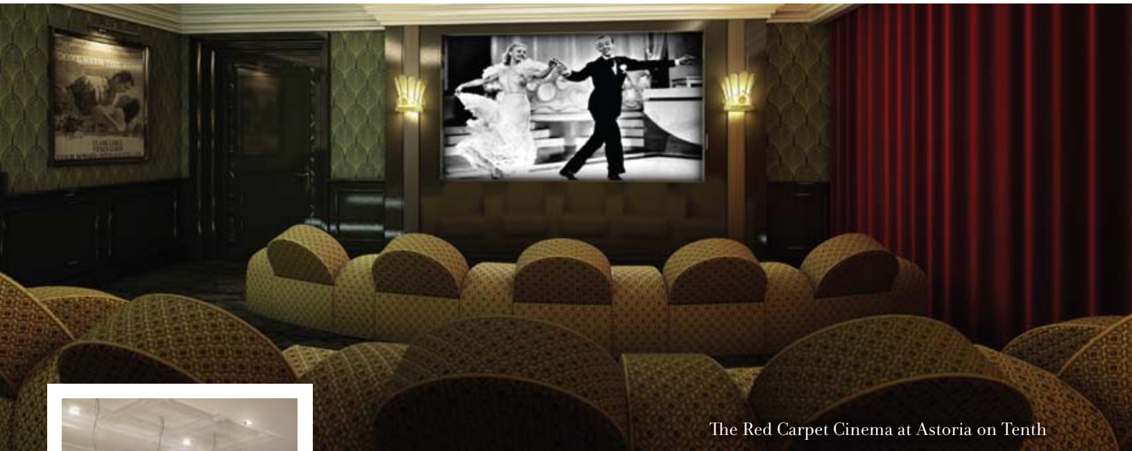
The Red Carpet Cinema at Astoria on Tenth