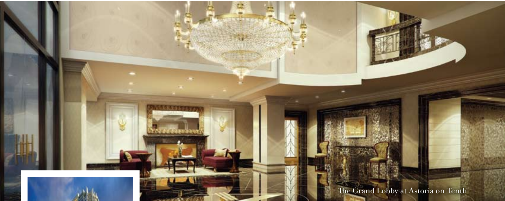
The Grand Lobby at Astoria on Tenth