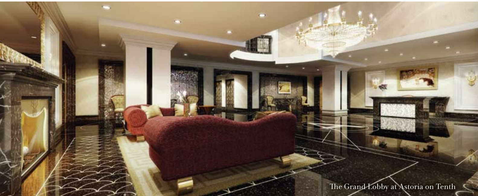
The Grand Lobby at Astoria on Tenth